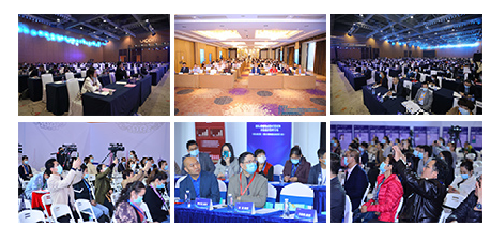
The China Association for Science and Technology (CAS) Consortium of Life Sciences Societies is proud to announce the upcoming 2024 China Life Science Conference and China Life Science Expo (CILSE), scheduled to take place from June 1st to 3rd, 2024, at the China Import and Export Fair Complex in Guangzhou, China.

CILSE has evolved into a premier event within the life science community, gaining recognition for its high-level conference specifications, expansive scale, robust academic leadership, and deep industry integration. Building on this reputation, the 2024 edition aims to elevate academic value and global influence, fostering international collaboration and knowledge exchange in the fields of life science and health.